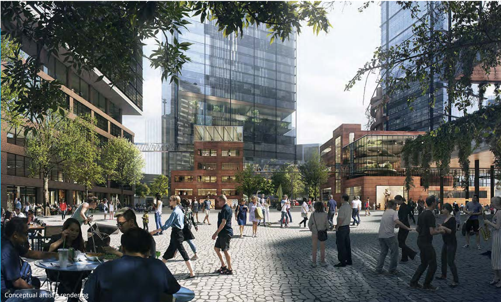
Conceptual artist's rendering