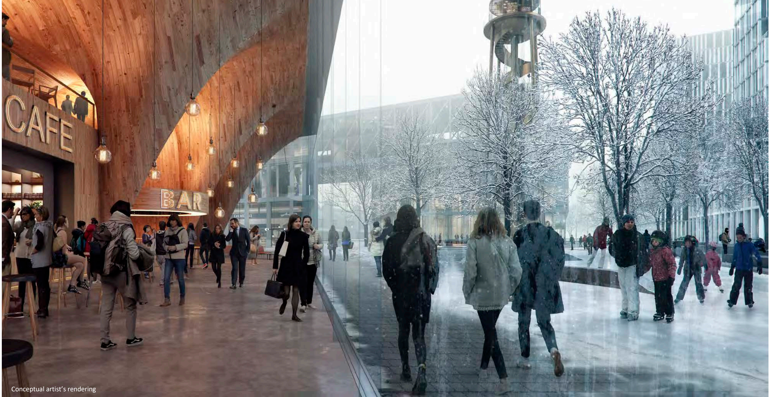
Conceptual artist's rendering